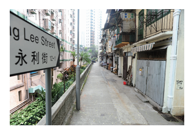
Excise of Site A including Wing Lee Street area is gazetted.