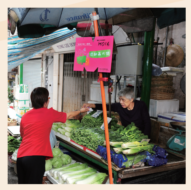
Promotional scheme for Graham Street market.

A comprehensive plan to address the needs and requirements of shops and stalls operating in the market