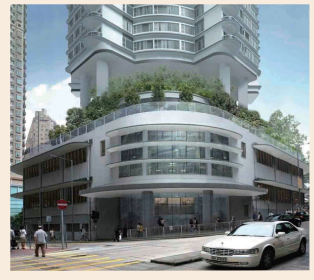
The core elements of the market building have been preserved in-situ.

Lee Tung Street was physically closed on 25 February 2010. In due course, Amoy Street will be opened up. Construction is now underway and completion of construction is targeted for 2015.