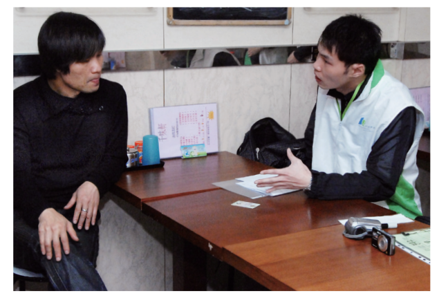
URA staff conducts freezing survey to ascertain the occupancy status.