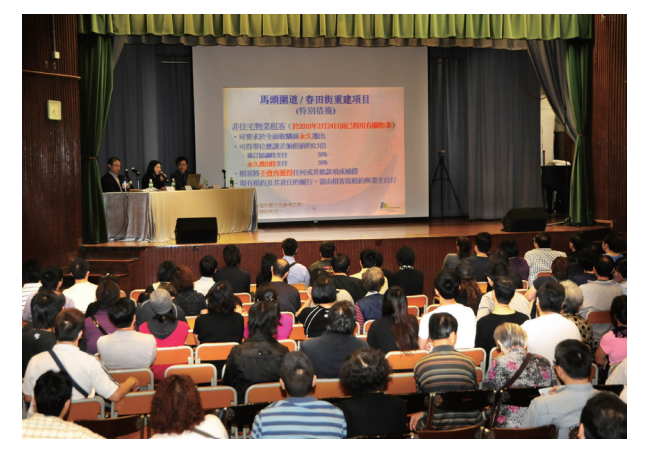
URA staff conducts resident briefing.

The URA intends to redevelop this project without private-sector involvement, and plans to have more than 400 small flats for the mass housing market. The existing retail-street pattern along Ma Tau Wai Road will be retained, and will be complemented by a low-rise retail podium that will provide around 1,000 square metres of GFA for Government/Institution and Community (G/IC) facilities. Around 500 square metres