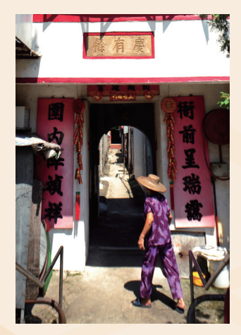
Three preserved items at Nga Tsin Wai Village: gate house and stone tablet above the gate and Tin Hau Temple.