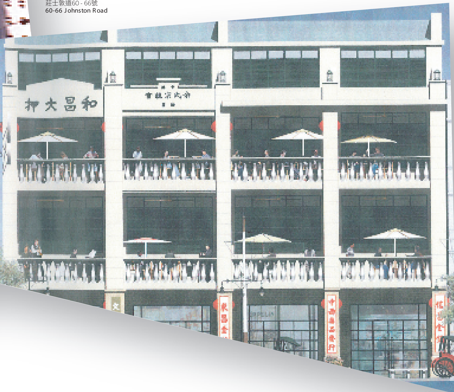
莊士敦道60 - 66號 60-66 Johnston Road

The URA undertakes its first preservation task at the Johnston Road redevelopment site. Four adjoining old Canton-style shop-houses and one in Ship Street will be turned into a place of tasteful lifestyle after refurbishment. We will also bring back the useful economic life of these buildings.