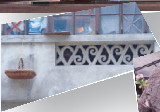
皇后大道東186-190號 186 - 190 Queen's Road East