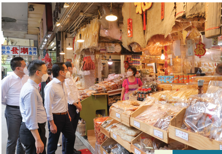
Having a chat with street shop operators in Kowloon City to learn about their business environment.

The planning studies we have undertaken are not limited to districts with large clusters of ageing buildings such as Yau Mong, but also cover areas where there are already redevelopment projects completed by the private sector. These areas are characterised by a mix of individual single-block buildings constructed in recent years and aged buildings, coupled with a lack of coordination in the overall planning and design for the built environment of the area. In view of this, the challenge for future urban regeneration lies in integrating old and new elements at the planning level, while increasing community facilities and retaining the local characteristics.