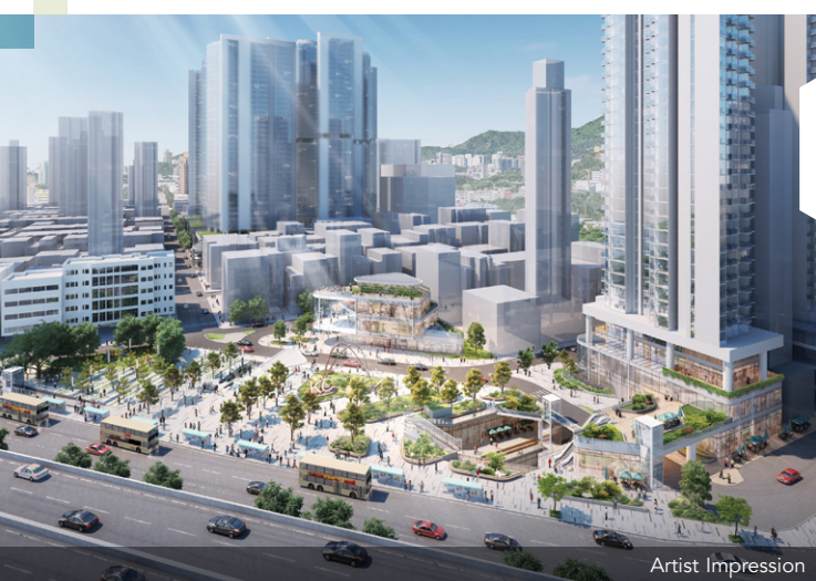
The Gateway Square in Nga Tsin Wai Road/Carpenter Road Project will link to Kai Tak Development Area strengthening the connections between the old and new districts of Kowloon City.

Nevertheless, various complex issues remain to be tackled during the urban renewal process, including integrating the old and new cityscapes, the challenges of sourcing relevant sites for reprovisioning government facilities, and the need to retain local characteristics. Therefore in May this year we began trialling an integrated approach to implementing our latest redevelopment project in Kowloon City.